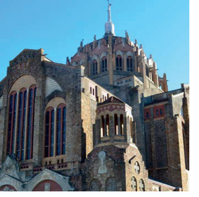
♦ TIES TO THE LOCAL AREA

By supporting the HR chair at UCO, ESEO and the École des Mines at Nantes.