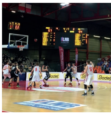
♦ HIGH-LEVEL SPORTS

Our societal commitment is boosted through sponsorship of the following three areas :