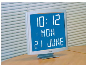
Opalys date on table support