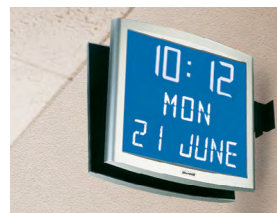
Opalys date on double-sided bracket