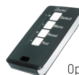
Option: wireless remote control