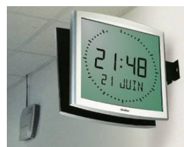
Cristalys Ellipse on double sided bracket