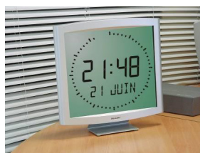
Cristalys Ellipse on table support

The NTP server must have a transmission (Poll) period of less than 128 seconds.